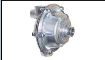
BRADY REPAIRABLE AIR VOLUME CONTROLS