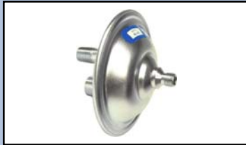
WELL PRO/BRADY NON-REPAIRABLE AIR VOLUME CONTROLS