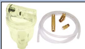
WELL PRO AIR CHARGER