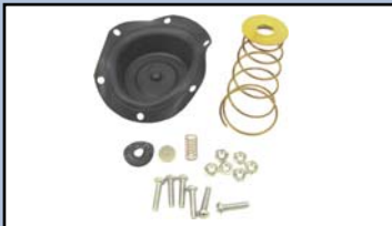
BRADY REPAIRABLE AIR VOLUME CONTROLS