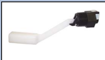
WAE10 AIR VOLUME CONTROL