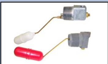
DEEP WELL AIR VOLUME CONTROLS