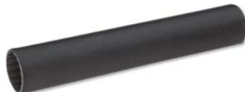
Extra Heavy Black Tubing