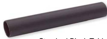
Standard Black Tubing