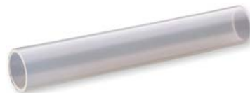
Standard Clear Tubing