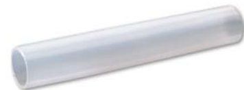
Extra Heavy Clear Tubing