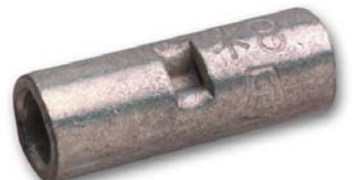
WSK825 Crimp Connector