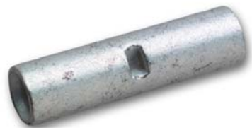
W1014 Crimp Connector