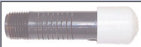
WELL SEAL VENT