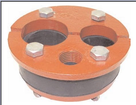
DOUBLE DROP PIPE SPLIT TOP PLATE